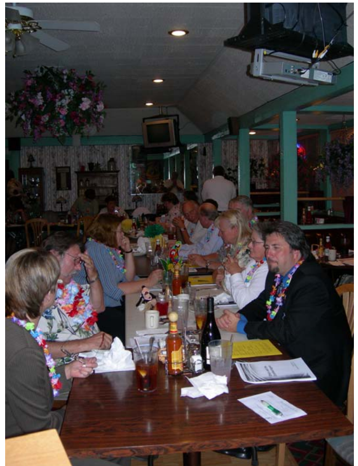
Members and guest having fun at Hawaiian Night.