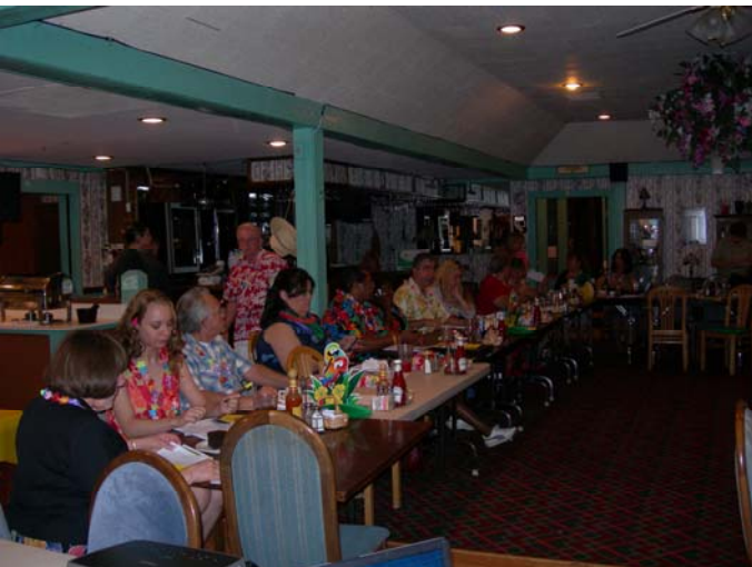
Members enjoying Hawaiian Night at our September dinner meeting.